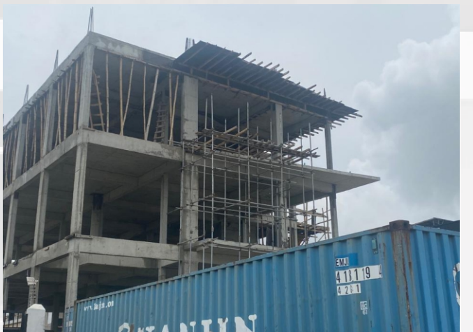
Proposed Office Development for Everyday kitchen Limited at Nike Art Gallery road Lekki